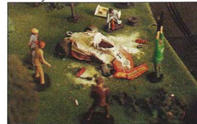
Nicki Lauda's wreck

There are no borders between members because we all share a common interest. We have at least one auction per year open to all members and their extra stock. We had a display for the first time at the NRMA Motorfest in NSW this year. The club has appeared on "Sydney Weekender" and "Healthy, Wealthy and Wise". We compile and distribute to all club members a monthly newsletter with