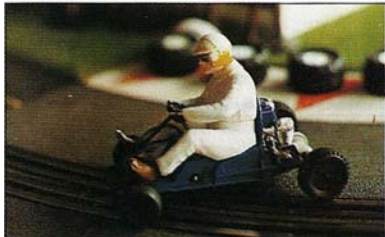
1963 GO-KART Remember this?

Scalextric has released numerous buildings, track dressings and specialist tracks over the years and these are keenly sought to complete a home circuit. Most of our members have their own track of some kind, depending on available room, some extensively landscaped and detailed to recreate a circuit that looks great and complements the types of cars they collect. Two, four and six lane Scalextric tracks are hidden away in members' garages, spare rooms and sheds. We do not operate through any commercial premises so all