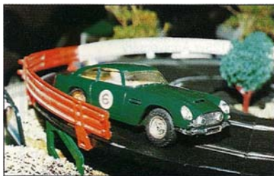
1963 Aston Martin DB GT.

club race meets are held in private homes. We have an organised set of race rules and classes and these are used at every club race meet. The causes start from 1960 onwards and include F1, road cars, Le Mans, Minis, Super Cars, four wheel drive, tourers, etc. the most common track layout at present is a four lane, about 20metres long with varying degrees of landscaping. Some tracks have electronic