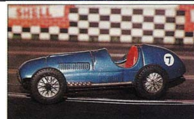
1953 4.5L Ferrari A tinplate model.

Grand Prix week in March. The class for the evening was naturally open Formula One with magnets (to help handling) raced over six heats per competitor. Apart from the organised club meets there are always social events happening through the many friendships the club has created. Despite the passion which we have for the hobby, which any modeller can understand, we do laugh a lot and make sure everybody enjoys themselves.