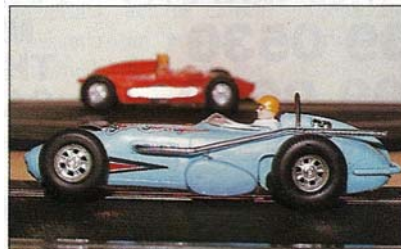
1966 Offenhauser Front engine speedster.

Grand Prix week in March. The class for the evening was naturally open Formula One with magnets (to help handling) raced over six heats per competitor. Apart from the organised club meets there are always social events happening through the many friendships the club has created. Despite the passion which we have for the hobby, which any modeller can understand, we do laugh a lot and make sure everybody enjoys themselves.