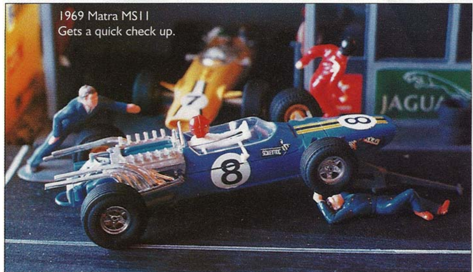
1969 Matra MS11 Gets a quick check up. timing through a computer or other device. The largest track within the club is in Melbourne in a garage. Six lanes, 110 feet of "good fun" with a computer lap counting and timing system. This would be the closest setup in size to a commercial Scalextric track but in a private residence. This track was used for our first national meet during the F1